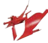
TURN-WREST PLOUGH 90°