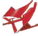
TURN-WREST PLOUGH 180°